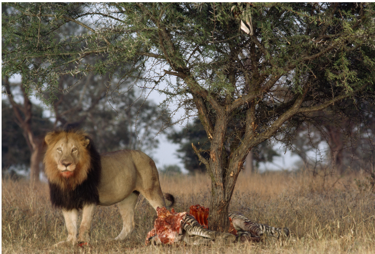
A MALE LION ( PANTHERA LEO ) GUARDS A ZEBRA CARCASS.

It is estimated that 500 lions eat more than U.S. $2.4 million each year (the meat value used is a very conservative $3 per kg – compare that to the price of steak in a supermarket, and then remember that the Buby Valley Conservancy used to be a cattle-ranching area, and if wildlife becomes unviable, then there is no reason not to convert it back to a cattle ranching area once again).