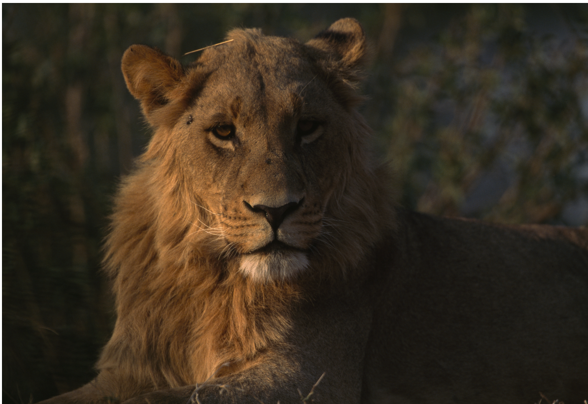
A PORTRAIT OF AN AFRICAN LION (PANTHERA LEO).